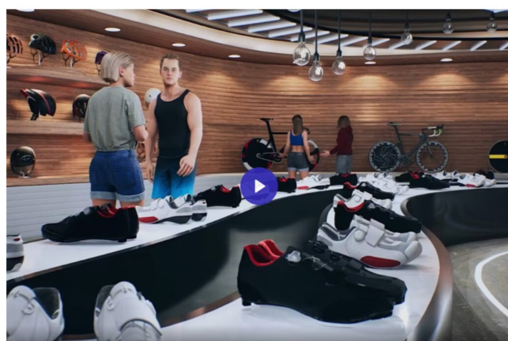
Revolutionizing Retail Experiences